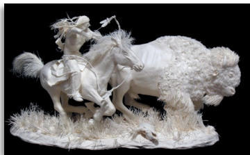
"Taking the Bull with the Bow"