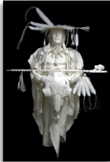
"Offering of the Buffalo Medicine"