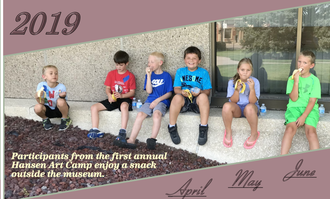
Participants from the first annual Hansen Art Camp enjoy a snack outside the museum.