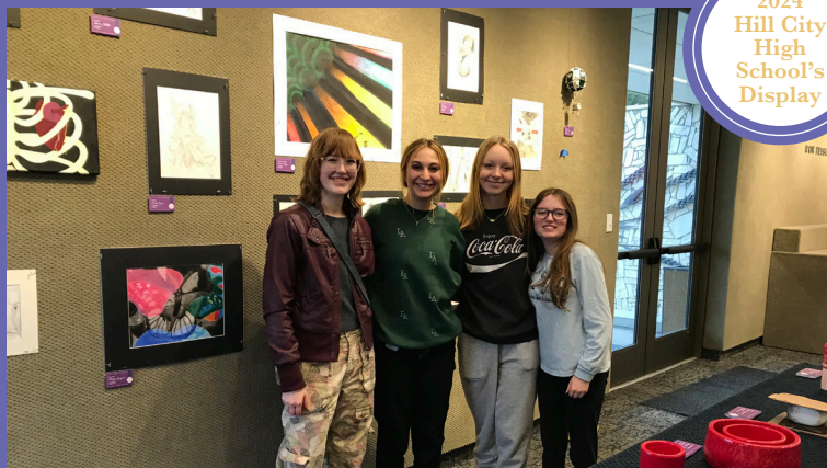
2024 Hill City High School's Display

The exhibition will be on view from January 31 to February 23, 2025. Visitors are invited to explore the gallery and discover the remarkable imagination and talent of high school artists. Each artwork represents a unique perspective, offering new dimensions of creative expression that reflect the vibrant artistic potential of our region's youth.