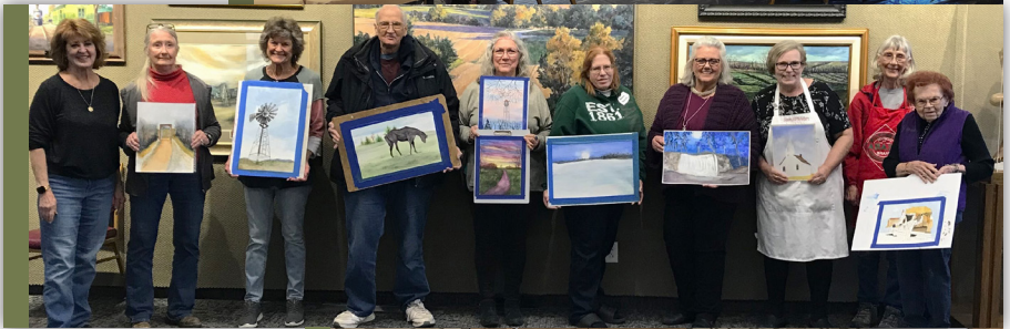
Fun classes and great events at the Hansen!