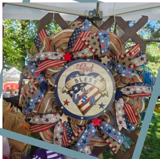
AIMEE SHARP CONCORDIA, KS Wreaths